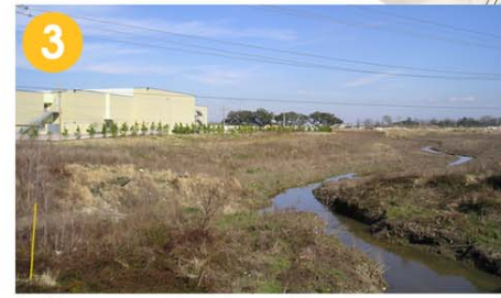
3 Trailhead behind Rave Theater