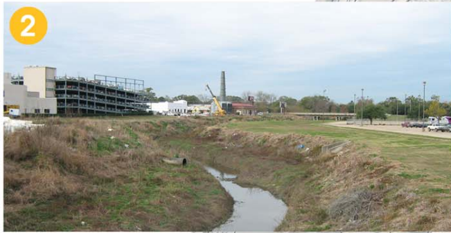
2 View of Perkins Rowe