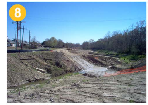
8 May need 60' Bridge