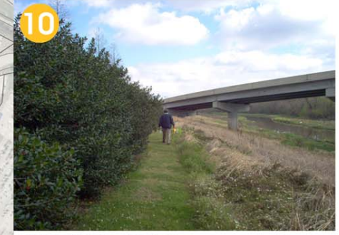
10 Pathway top of bank