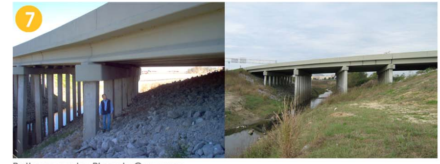
7 Pathway under Picardy Overpass