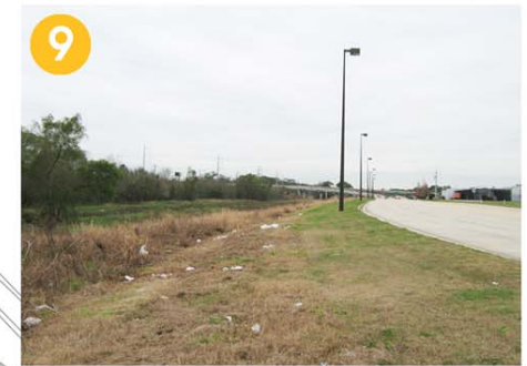
9 Trail by Tuscany Villas