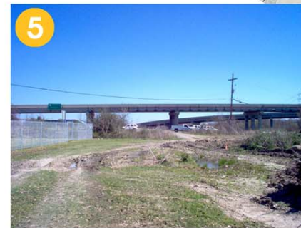
5 Pathway under Siegen Overpass