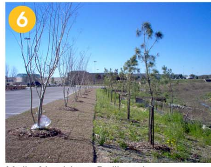
6 Mall of Louisiana Trailhead