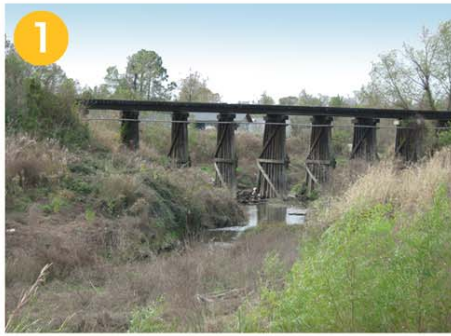
1 Path under RR